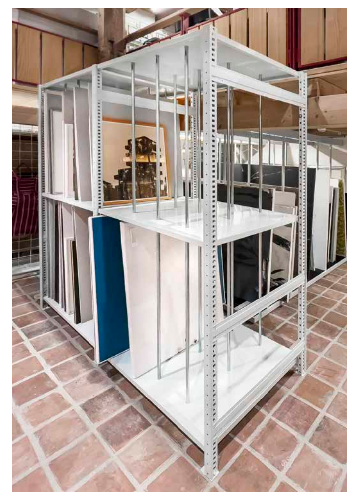
Pole rack conservation warehouse Liestal, BL.

Shelving racks are suitable for storing works of art such as statues, fossils, figurines and other three-dimensional artefacts. They do not require additional subdivisions, which favours a clear and open presentation of the art objects. The shelves are robust, stable and provide an even storage surface. «ArtStore» Shelving racks are available in various sizes as well as configurations and can be placed at different distances to create enough space for the individual items, depending on the needs of the art collectors. Another advantage of Shelving racks is the easy and safe maintenance of the artworks. They do not need to be additionally attached to the shelving and can therefore be quickly and easily replaced, which increases efficiency, for example when preparing for exhibitions.